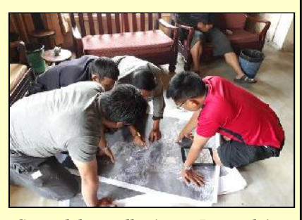
Ground data collection at Lawngtlai under HRVA project