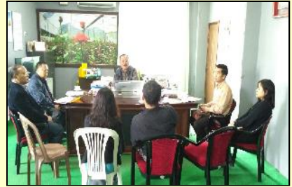
Meeting with Horticulture Dept. for CHAMAN (2nd Phase) project