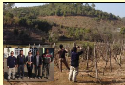
Ground truthing at Champhai for CHAMAN project