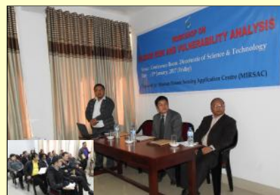
HRVA Workshop at Science & Technology Conference room.

* The Governing Body Meeting of the Centre was held on 1st June, 2017 at Chief Secretary’s Conference room.