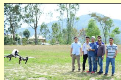
UAV Training at Kohima, Nagaland