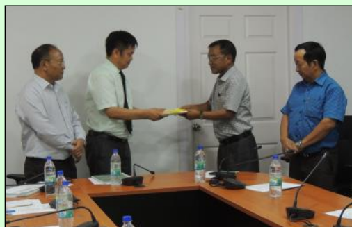
Report on Sericulture Development (2nd Phase) handed to Secretary, Sericulture Department, Govt. of Mizoram

The project got positive feedbacks from the officials of Sericulture Department and its effective use for sericulture development in the two districts was envisaged. The success stories achieved from previous phase was also shared and appreciated by the Department.