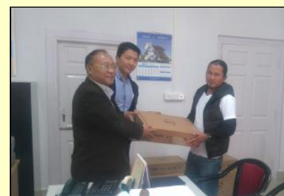
NeDRP systems hand-over to DC Officials