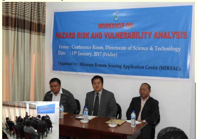
HRVA Workshop organised at Dte. of Science & Technology