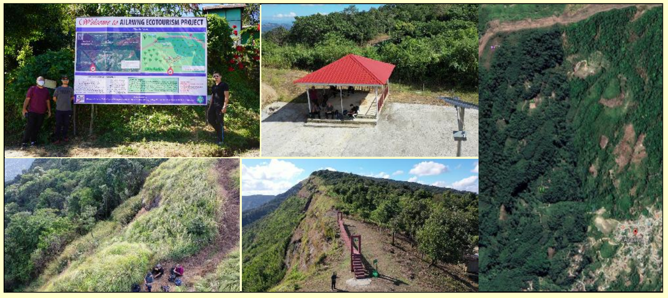
UAV Site Inspection at Ailawng Eco-tourism spot

* Pu C.Lalzawngliana, Field Assistant was detailed for UAV ground survey and data collection at Kolasib under the Kolasib Master plan preparation activities (Base map preparation) from 30<sup>th</sup> November - 3<sup>rd</sup> December, 2021.