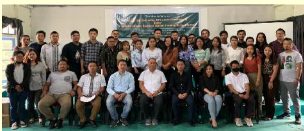
Training at Serchhip