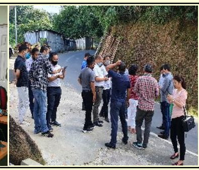
Hands-on demonstration for Smartphone data collection & GIS data visualization