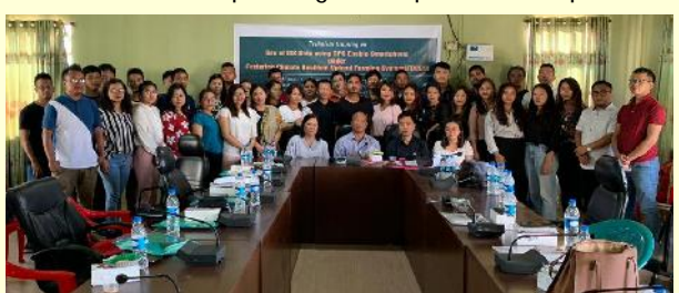
Training at Kolasib